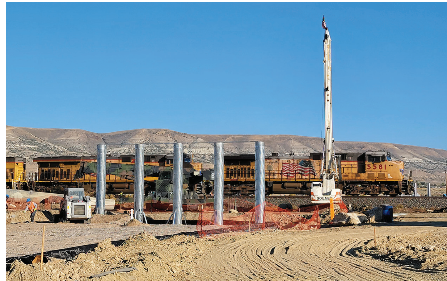
Work being done on a project just east of Rock Springs as a Union Pacific train passes by.

Project includes the replacement of an existing bridge over I-80 to provide a higher vertical clearance; on- and off-ramps