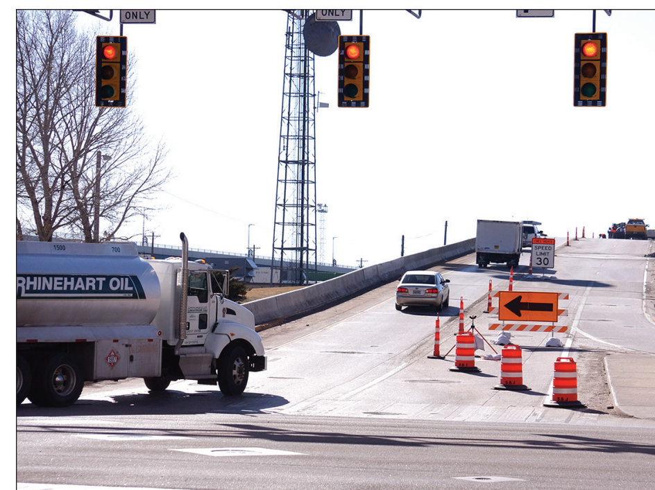
As projects get underway across the state, travelers are advised to put away distractions and watch for traffic signs and warnings. Keep our workers safe by obeying the Move Over Law.

Within the town of Cody, crews are working on a two-year concrete rehabilitation project on US 14/16/20 between 10th Street and Stampede Avenue. Updates on that project, which runs through the heart of town, can be found on Twitter at #CodyImprovements.