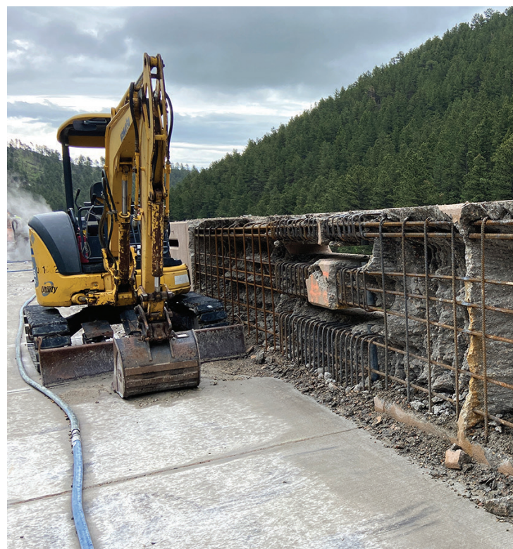
A glance at a portion of the runaway truck ramp inside wall with the original concrete removed, exposing the rebar that will be modified to accommodate the new pocket system as part of the retrofitting operation.

Work began the week of May 29 and is scheduled to be complete by Sept. 30, 2023.