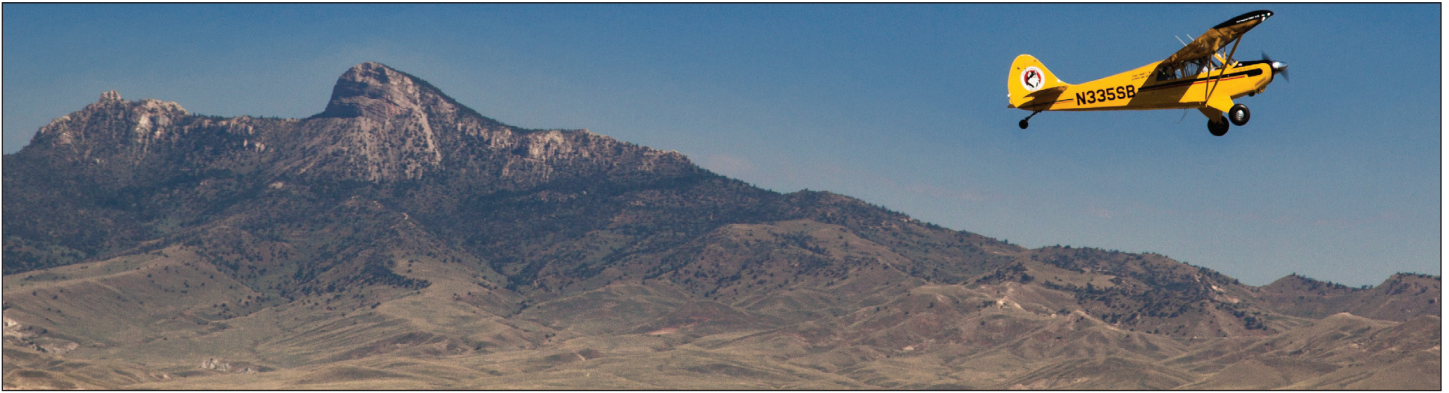
A Park County Search and Rescue plane, an Aviat Husky, flies out of Yellowstone Regional Airport on July 18.