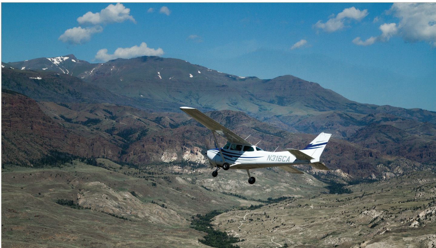
A plane flown by Choice Aviation pilot and instructor Sheena Cichosz flies over the North Fork near Cody on July 18.