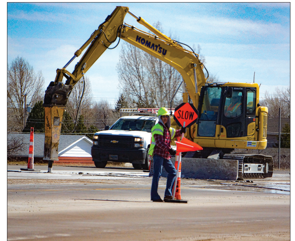
Keeping speeds lower through work zones and putting down distractions protect construction workers, as well as drivers.

When driving through a work zone, motorists can encounter changing traffic patterns and increased activities from crews. For example, if crews are working on one lane of a two-lane