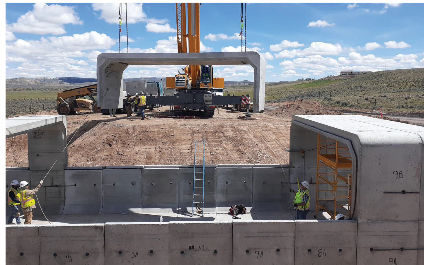
The Dry Piney underpass being constructed.