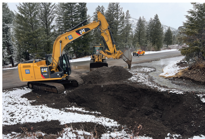
WYDOT crews used an excavator and other heavy equipment to open up an important, clogged box culvert to carry mountain stream flows and debris under US 14/16/20 near Yellowstone National Park.

“Danger was increasing for motorists, especially with ongoing spring storms in the area,” Lamb said. “The emergency project in Wind River Canyon was necessary to prevent a catastrophic, long-term highway closure.”