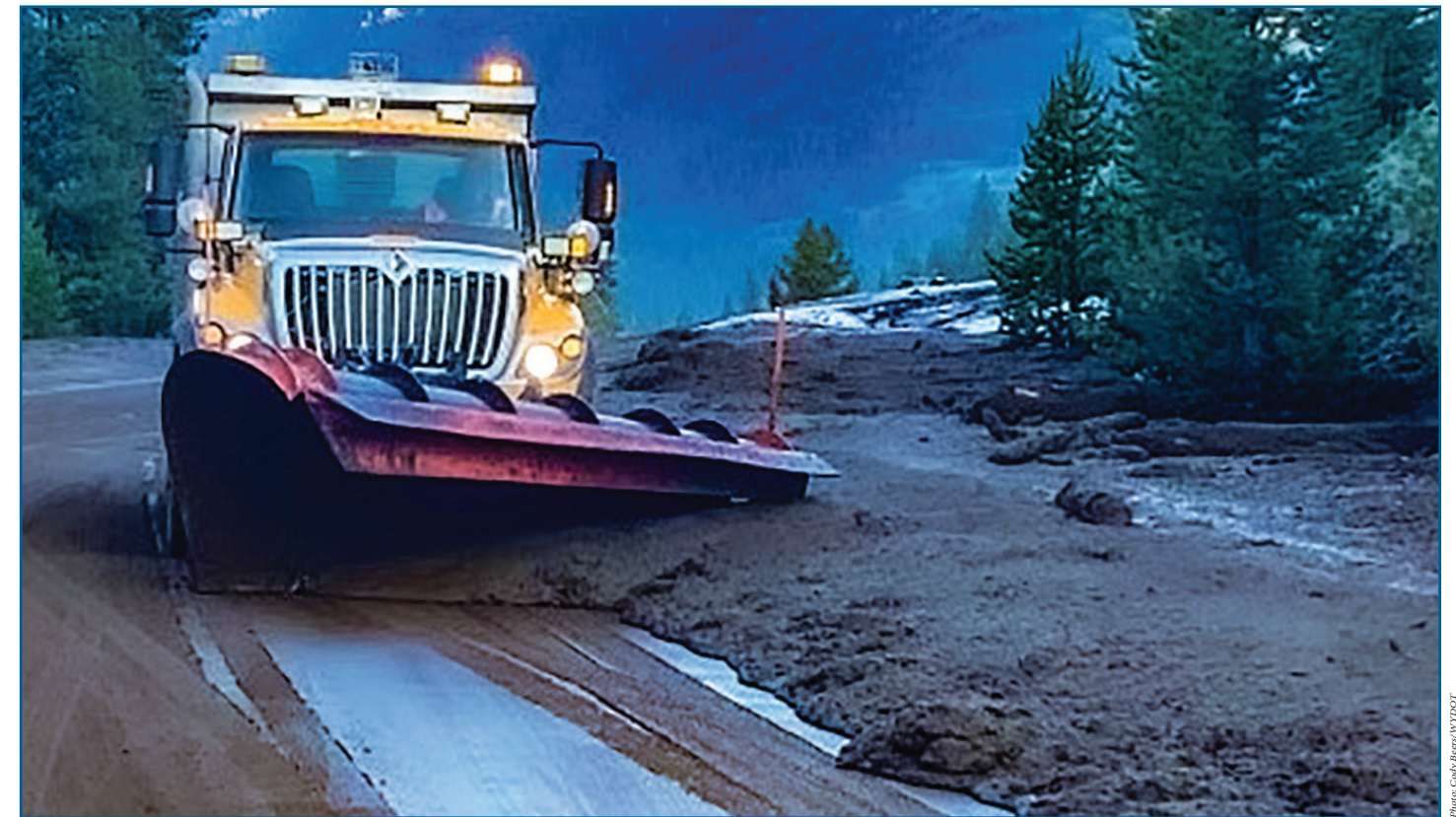
A District 5 snow plow plows mud on US 14/16/20 near Yellowstone in June after a mudslide above the highway was triggered by large amounts of rain, snowmelt and snow. WYDOT worked through the night to reopen one lane of the highway, and after 24 hours, two lanes of the roadway remained open as mud flows slowed.

Emergency projects mitigate mudslides, flooding in District 5