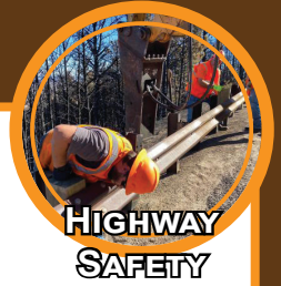
2025 WYOMING VS. NATIONAL FATALITY RATE