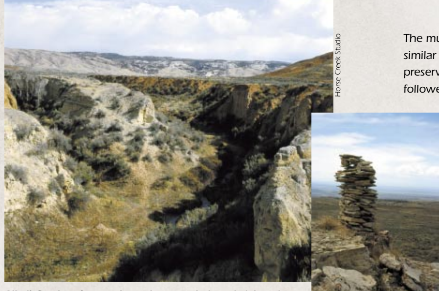
Alkali Creek as it runs through an eroded wash (above), and rock cairn trail marker near the juncture of Alkali Road and Red Gulch Road (right).

Visitor Center, which is open during summer months, describe the artifacts and the prehistoric people's way of life.