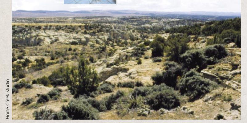
Sagebrush, juniper in a weathered limestone canyon near the summit of Alkali Road, (top) porcupine in a drywash cottonwod.

Although there are no developed sites along the Backway, visitors may stop along the road to picnic or camp on public lands. Spectacular scenic views offer outstanding photographic opportunities. Area antelope are patient with photographers—to a point.