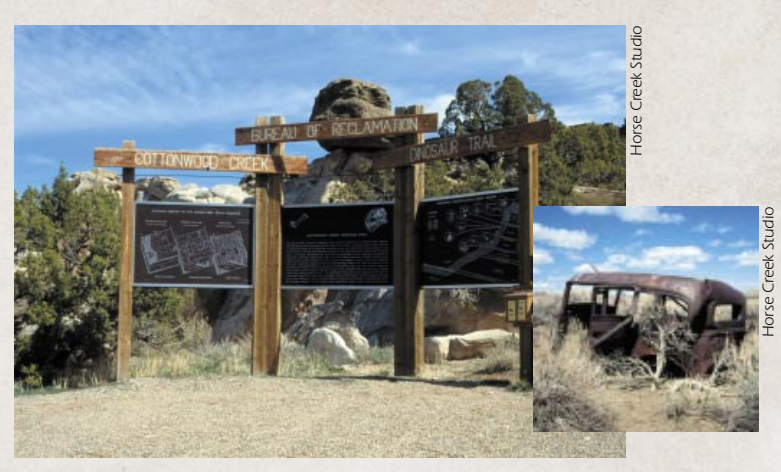
Cottonwood Creek Dinosaur Trail Area signage describes the area's prehistoric dinosaurs while the shell of a more recent "dinosaur" bakes under a strong Wyoming sun (inset).

public access. For that reason, they are uncrowded and have great allure to the most adventuresome cross-country hikers and backpackers.