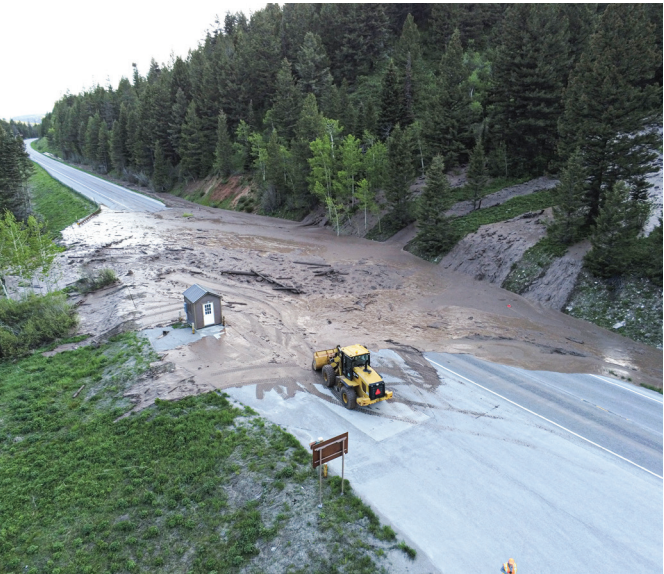
On June 7, a mudslide was reported on Teton Pass (WYO 22) near mile marker 15. Idaho Transportation Department was a big help in clearing this mudslide, and crews with Avail Valley have begun work on a culvert to address the slide before the road reopens.

Updates will be available as construction continues, check out our media kit: https://www.dot.state.wy.us/home/news_info/media-kits.html