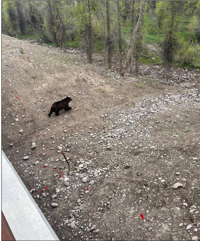
A bear recently used one of the new wildlife crossings available as part of the Snake River Bridge Replacement Project in Teton County.